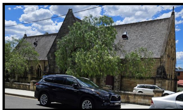
St Marks Church Granville