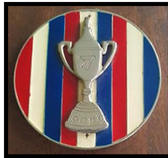
AMCO Cup Winners Plaque 1977