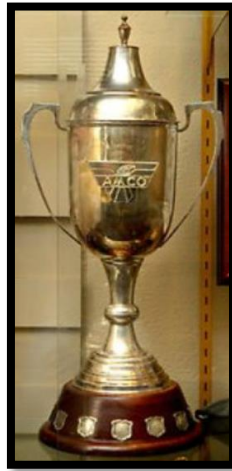
Western Suburbs DRLFC AMCO Cup Winners 1977

He made his way back to the top team by round thirteen and was part of Wests charge to AMCO Cup glory. He played in the AMCO Cup quarter final win over St George and then from the bench in the semi-final against St George. That was the last game he played in 1977 thereby missing the opportunity to play in the AMCO Cup Final in which Wests defeated Easts 6-5.