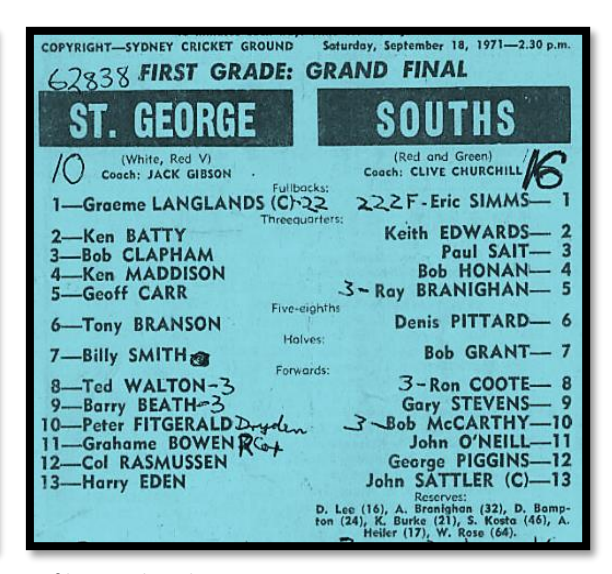
1971 Grand Final Player List and Player Profiles South Sydney 16 v St George 10