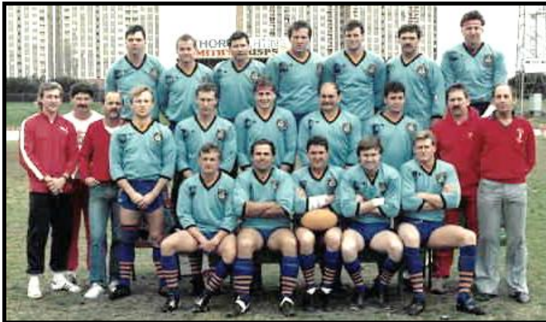
NSW Police Rugby League Team 1980 – Tour of New Zealand

The NSW Police rugby league team did play some football in 1980. A 23 man contingent toured New Zealand in September of that year. They played two matches against combined New Zealand Police teams, the second of which at Auckland was for an annual shield. The New Zealanders proved a little too strong for the tourists, winning the decisive match 29-22.