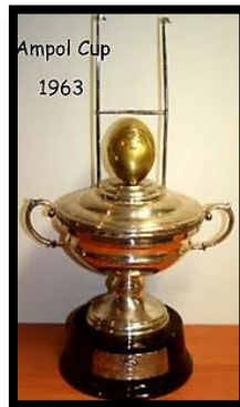
Wests AMPOL Cup Winners 1963