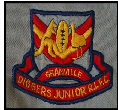
Preliminary Match to the Parramatta v St George Ampol Cup Semi Final 1 September 1963

He played with Granville Diggers from 1963 until 1969 and from here he was selected to play with Wests S G Ball team in 1966 and Wests Jersey Flegg team in 1968.