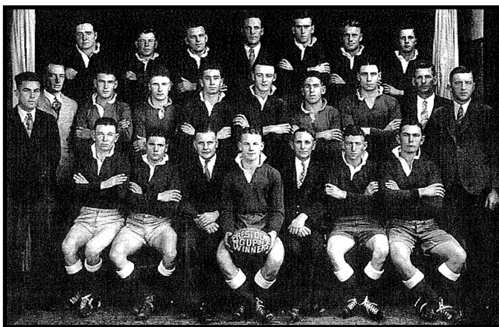
Southern Districts Winning President's Cup Squad 1934